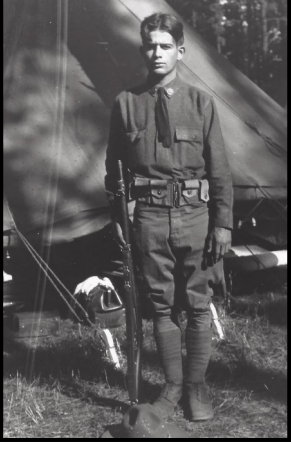
(continued on page 5)

portance of military training as a benefit to the nation and the individual taking such training; to inculcate selfdiscipline and obedience; and to develop these voung men physically, mentally and