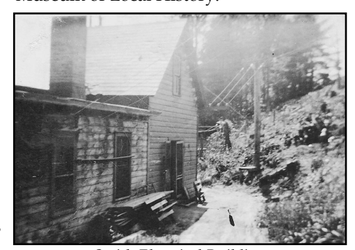
Smith Electrical Building See also two photos on page 5

Many of the items listed can be found in Discover Warrensburg, the Warrensbugh Museum of Local History.