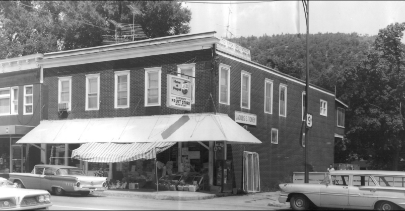
Adirondack Fruit Store Circa 1957