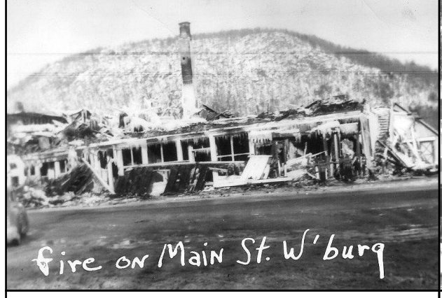
Ruins of the Music Hall after Dec. 1950 fire