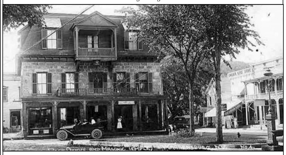
Woodward Block (stone): Masonic Lodge and Post Office. The store is directly behind the McNutt Fountain.