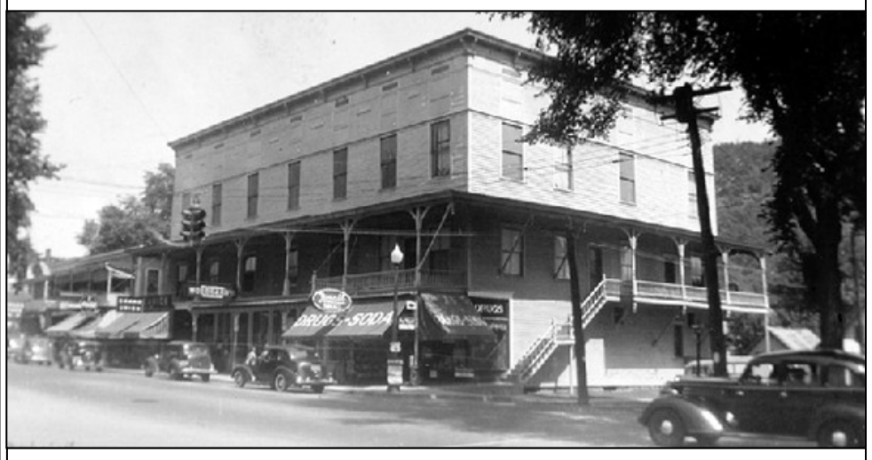
Music Hall, 1940s. Adirondack Fruit Store at far left.