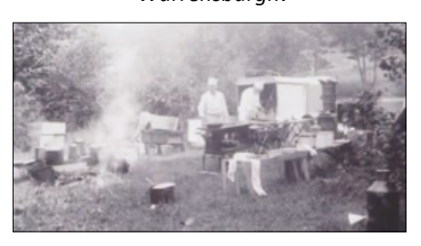
Chefs prepare the gourmet meals. The special kitchen vehicle is in the background and in the photo at the top of the next column. It is also the third vehicle in the caravan picture above.