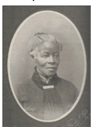
See "Warrensburg New York, 200 Years of People, Places & Events" p.100.