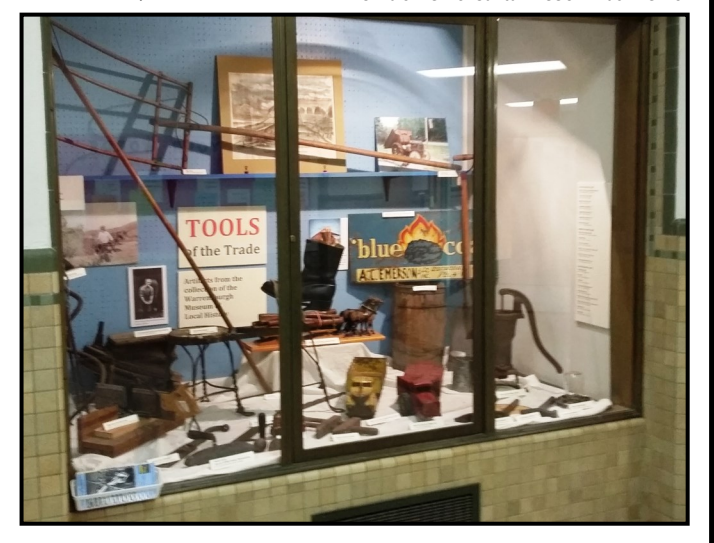
Tools of the Trade - Elementary School Window Display