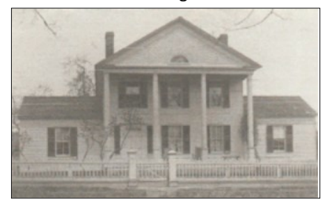
The King House in the 19th century. Photo p. 118 "Warrensburg New York, 200 Years, People, Places and Events."